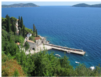
Arboretum, Dubrovnik, Croatia