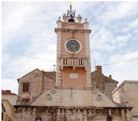
Photo in Zadar, Croatia