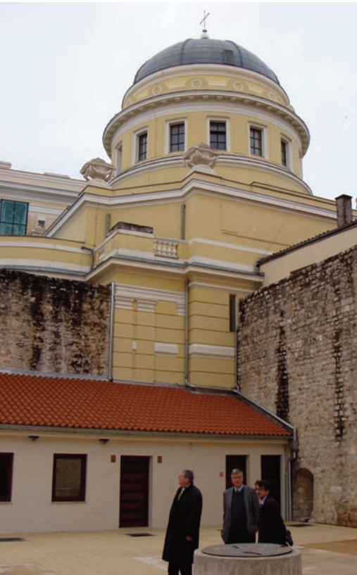
University of Zadar Courtyard