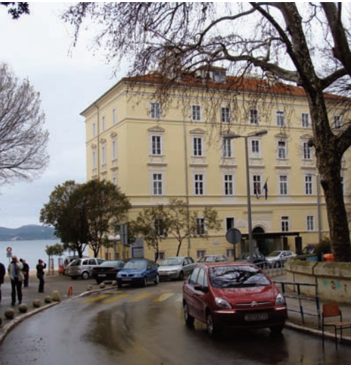
University of Zadar administration building