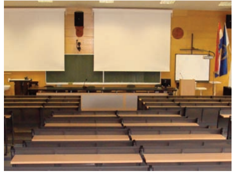
Zadar, interior of main classroom

Admission is open to any U.S. or Canadian law student who has completed one year of full- or part-time study, and who is in good standing at an ABA-approved law school. Students at law schools not approved by the ABA Standard 506, and whose admission is consistent with Standard 501, are also welcome to apply. The sponsoring schools have applied for and anticipate accreditation of the 2010 summer program by the American Bar Association, thereby entitling U.S. law students to course credit toward graduation at their respective home institutions. However, each applicant's school still has the discretion whether to accept the transfer of summer credits. While most schools will accept summer credits, each applicant should determine the policy of his or her school in advance. Applicants who are interested in using this summer credit to accelerate graduation should check with their Registrar's Office to determine whether this summer program meets residency requirements. It is unlikely that the credits in a foreign summer program can be used to accelerate graduation.