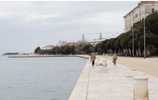
University of Zadar beside the Adriatic Sea

(1) an overview of the nature and structure of international business transactions; (2) an overview of mediation and arbitration as private means of resolving international commercial disputes; (3) a brief introduction to private international law and comparative contract law principles; (4) an in-depth study of the law governing international sales of goods, with a focus on the CISG; (5) an in-depth study of the law governing international commercial arbitration and enforcement of arbitration awards, with a focus on the UNCITRAL Model Law and the New York Convention; and (6) the development of analytical, research, oral advocacy, and written advocacy skills in the context of a dispute arising out of a practical problem based on a fictional international sales transaction.