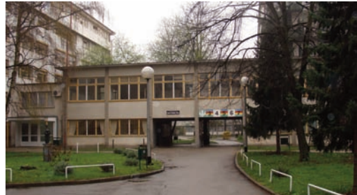
Exterior of the Zagreb dorms

In Zagreb, students will be housed in the dorms of the University of Zagreb Faculty of Law - a short convenient trolley ride from the school where classes will be held. University meal plans will be made available to students.