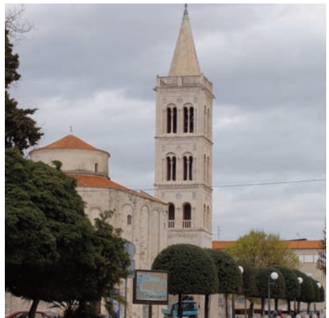
Photo of Zadar

Admission may also be open to attorneys or other law graduates (from any jurisdiction) on a space-available basis to audit classes or to take classes for continuing legal education purposes.