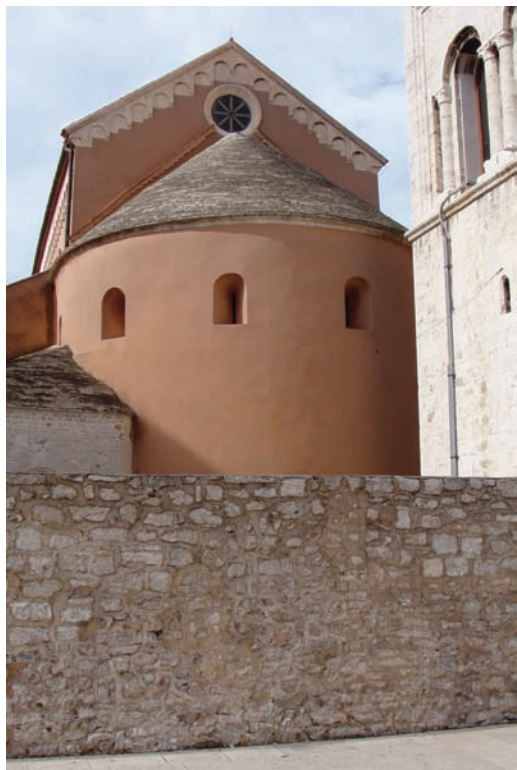
Photo of Zadar