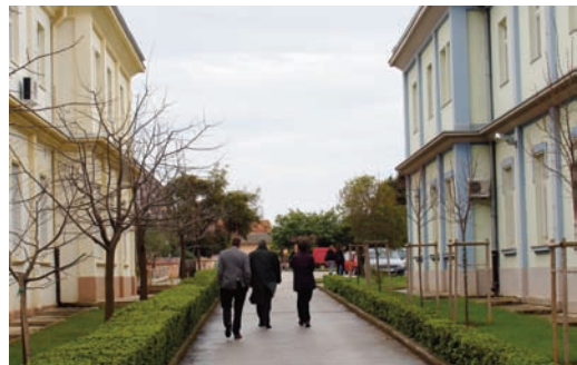
Exterior of the Zadar dorms

All classroom and dormitory facilities will include Internet access (computer labs and wireless access for your personal computer).