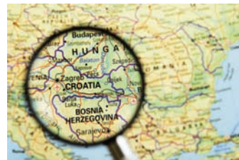
Map of Zagreb